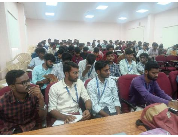
Page 3 of 3